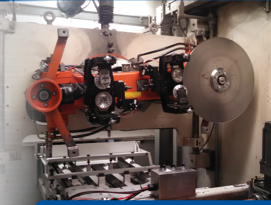
PCMC Prolog With the IKS grinding system

has developed a bolt-on grinding system for many OEM log saw machines for the tissue converting industry. Machines such as PCMC, Perini, Futura, United Converting, and Ital have all seen positive benefits from the IKS grinding system. These benefits include reduced safety risks, reduced cost-per-cut, and increased production and performance.